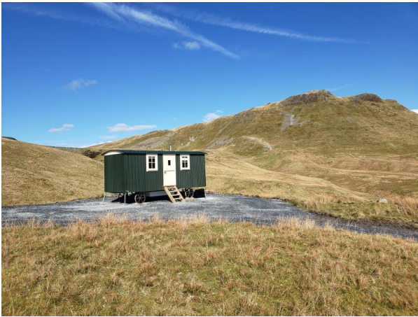
Moel Penamnen dominating the skyline.

There are several options to explore from here, but a circular walk that includes Dolwyddelan is a good one. Dolwyddelan has a shop and a pub called Y Gwydyr, so make sure to check their opening times. Dolwyddelan Castle is also worth a visit, although it is currently closed due to the pandemic. However, you can still enjoy the view from the top and the public footpath goes right past it. If you want to explore further, there are several tracks and footpaths around Cwm Penamnen that you can follow. The distance of the circular walk starting from your hut is 21km.